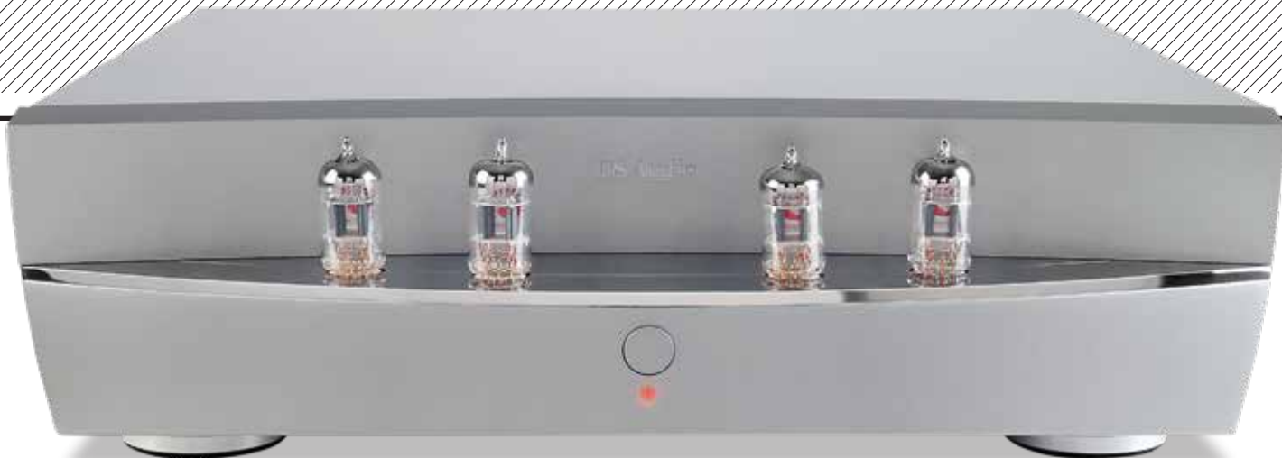
ABOVE: The TB-100's gunmetal grey casing is reminiscent of DS Audio's Master series equalisers, but seen here boasting ECC82/12AU7 triodes on a mirrored platform

avoid switching on the energiser before all connections have been made.